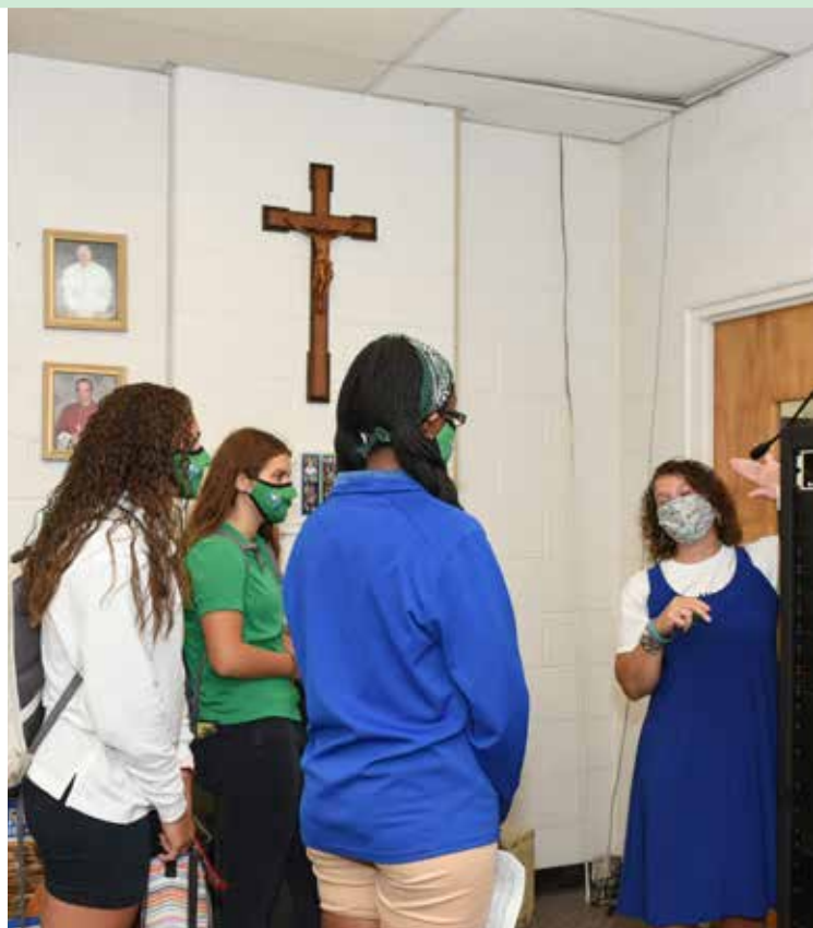
Students begin the day with prayer and pledge.