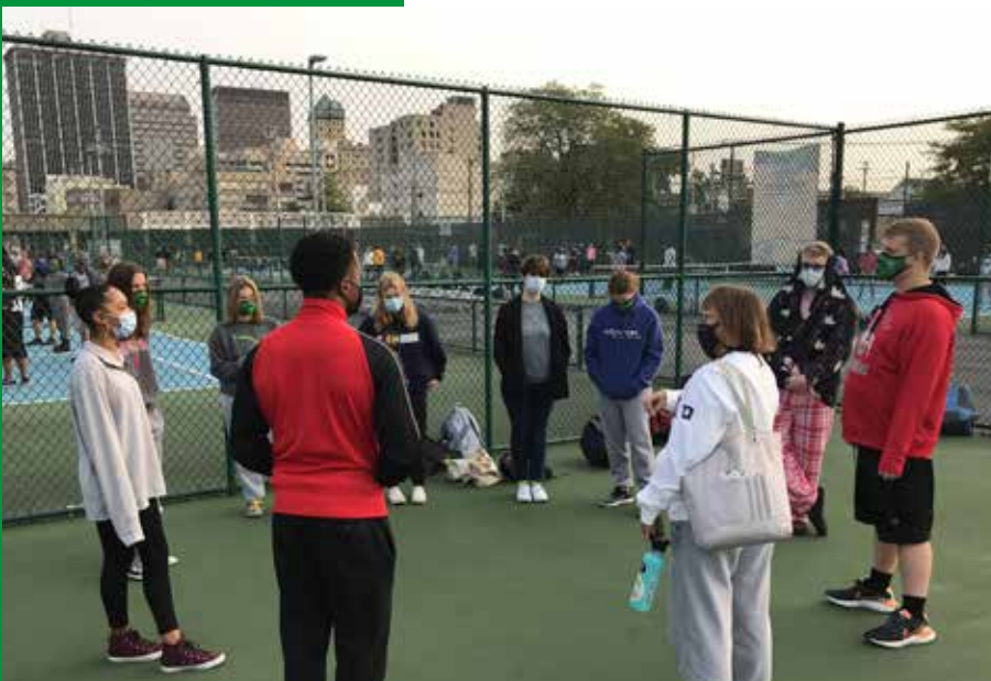
Morning circles allowed classmates to gather in small groups to check in with each other before the start of classes.